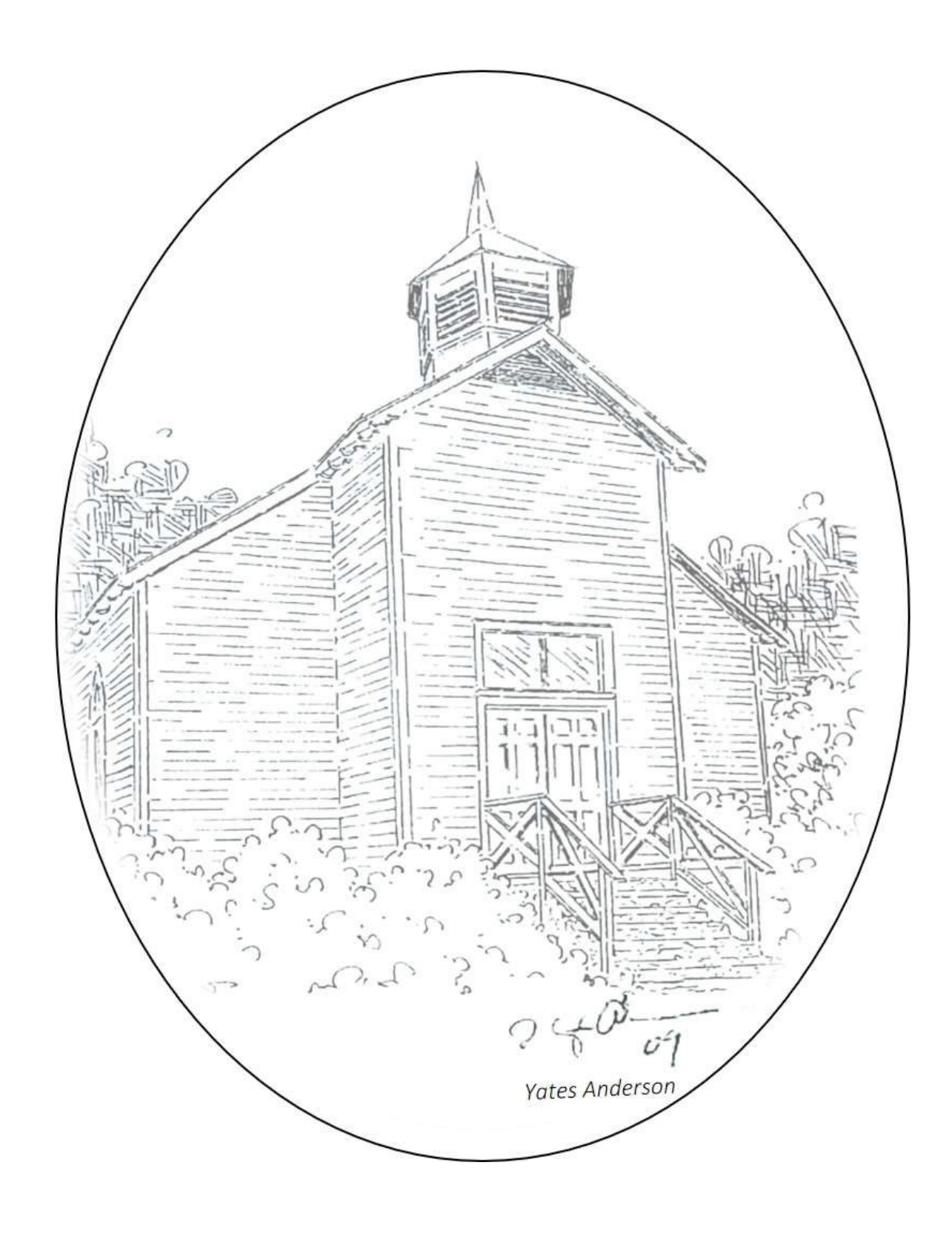
Lake Toxarvay United Methodist Church February 16<sup>th</sup>, 2025